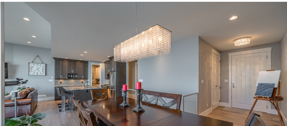
OPEN CONCEPT LIVING