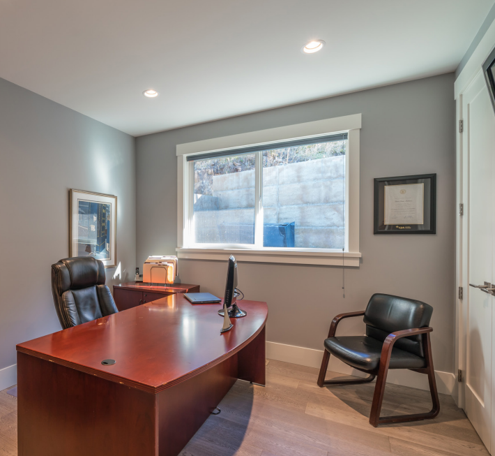
COMFORTABLE OFFICE SPACE