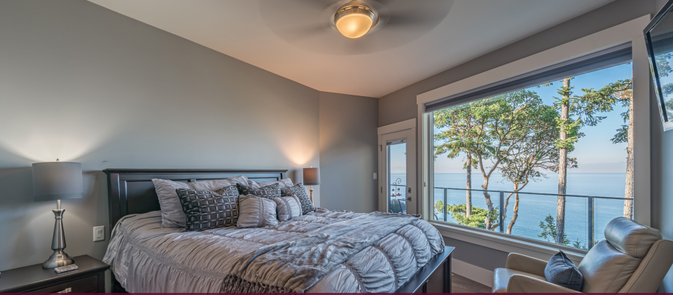
MASTER SUITE WITH OCEAN VIEWS