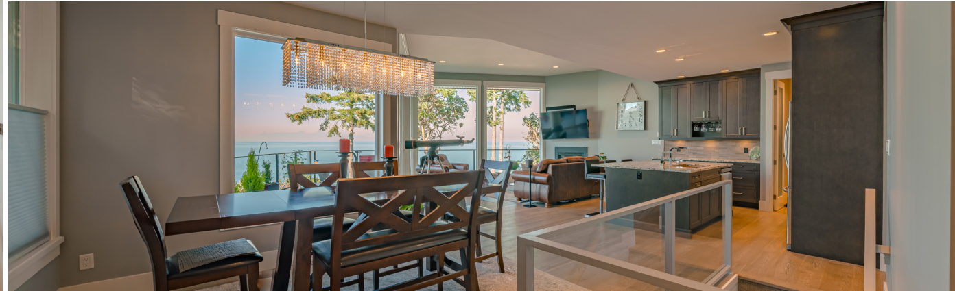
MAIN FLOOR OPENS TO KITCHEN, DINING & LIVING ROOM