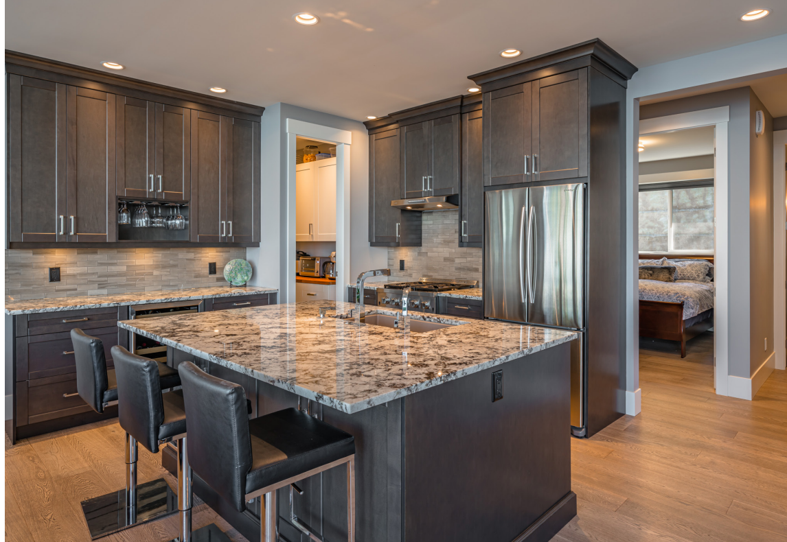
LARGE KITCHEN FOR ENTERTAINING