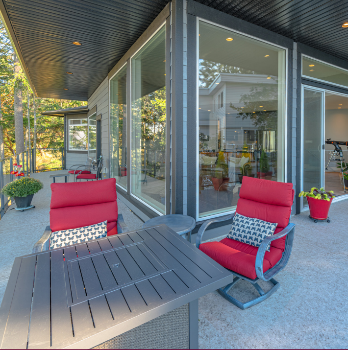
LARGE DECK WITH VIEWS